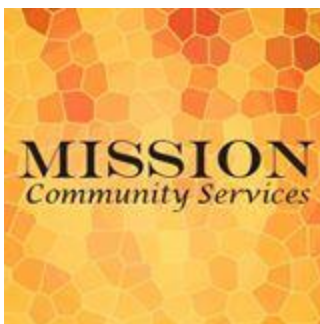
Mission Community Services