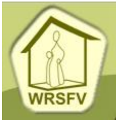
Women's Resource Centre of the Fraser Valley