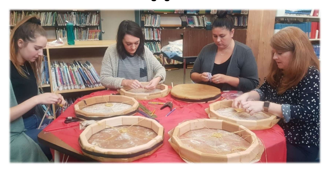
-ESR Drum Teaching and Making Workshop