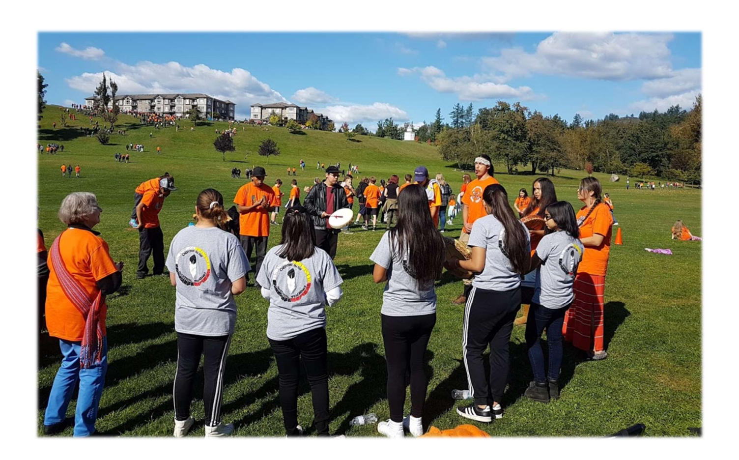
-Orange Shirt Day March for Reconciliation, September 2019

By resilience, and through the resurgence and revitalization of language, ceremonial practices and culture, Indigenous peoples are 'restorying' the past and walking toward a shared future.