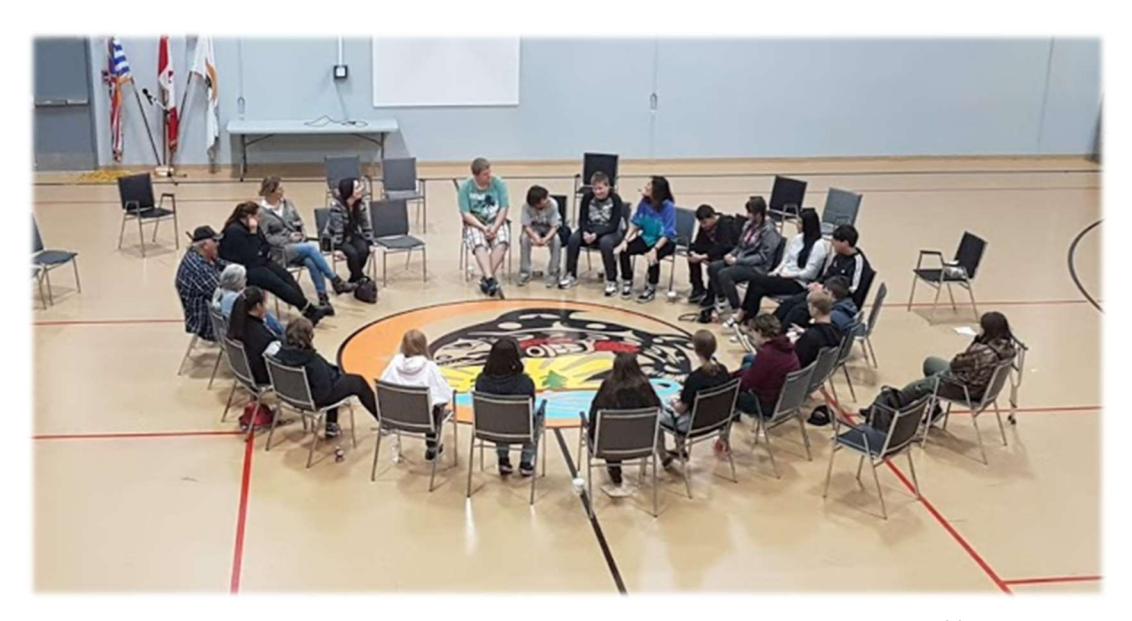
-Sacred Circle Workshop, Fall 2019, Leg'á:mel Gym