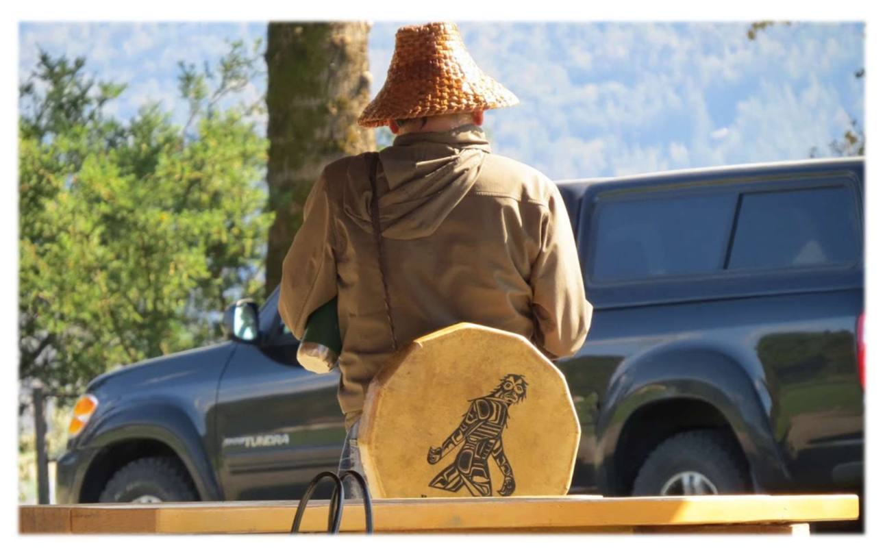
-Kwantlen Elder, Lekeyten, Orange Shirt Day March for Reconciliation, September 2019