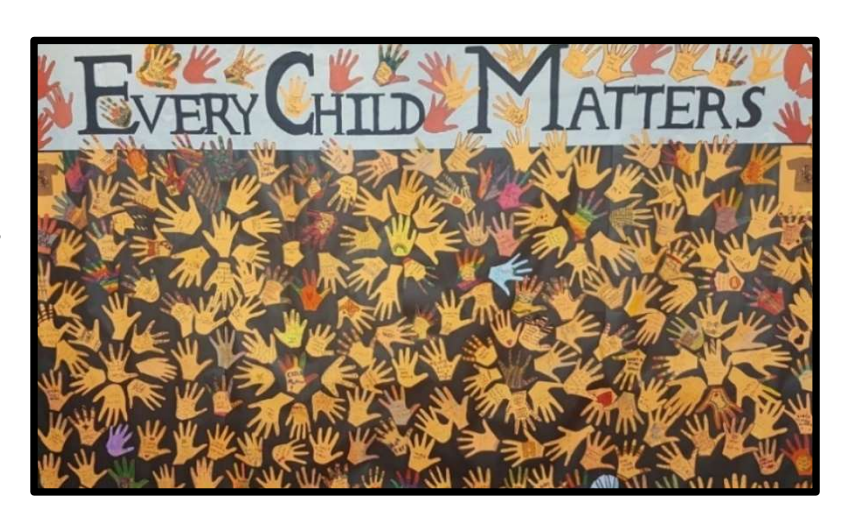
-Hatzic Middle School Foyer Display

The Equity Scan is a standing topic on the following meetings: weekly Senior Management, focused Equity Scan Facilitators, monthly Management/Exempt, Committee of the Whole, monthly Siwal Si'wes Advisory Council, and monthly Siwal Si'wes Staff.