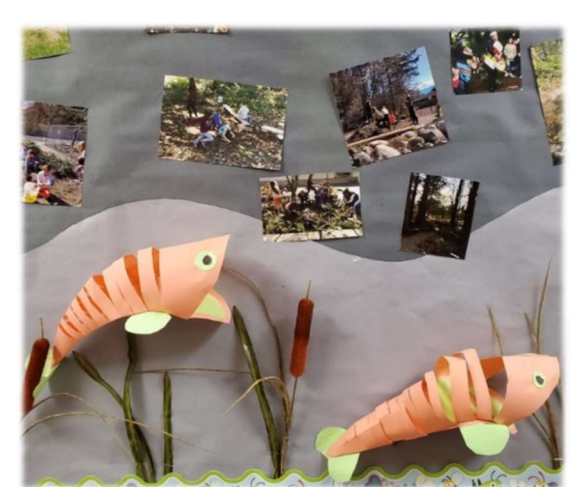
-Deroche Elementary School, Field of Streams Display

This document is a working document, in that each Pillar Group, through discussion and dialogue will commence an examination of current practices, processes and policies, alongside measures of evidence, leading to Action Plans, resulting in increased equity for Indigenous learners and knowing that we are making a difference, but also knowing how we are making a difference.