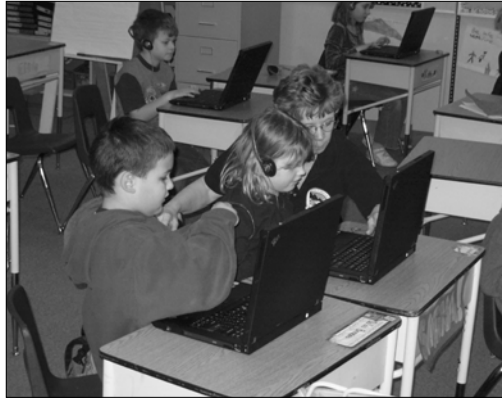
Using the laptop mini-lab

toward mathematics and to increase the level of knowledge and skills related to numeracy and problem solving