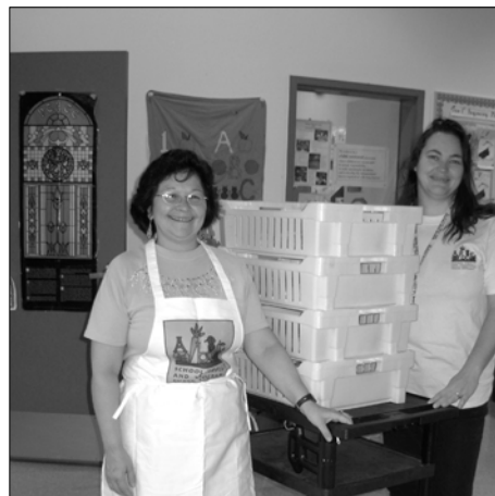
Parent volunteers - Fruit and Vegetable Program

Last year Deroche Elementary purchased the Math Makes Sense Program (MMS) for our Intermediate Department (we were already using MMS with our primary students) and, with the help of the District's Math Helping Teacher, our staff began implementing the program school