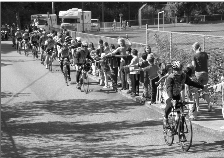
Cops For Cancer arriving at Deroche

Division 2 recycle all the tetrapaks, pop tins, and bottles which accumulate Caring for Others - students at Deroche Elementary are learning to care for others through their participation in a variety of charitable programs. Traditionally, our students raise funds for the Terry Fox Foundation, the Tour for a Friend Foundation (Cops for Cancer), U.N.I.C.E.F., the Variety Club Telethon, the Easter Seals Campaign, and the B.C. & Yukon Heart and Stroke Foundation (Jump Rope for Heart) Student Council - the Deroche Elementary Student Council meets regularly to discuss an assortment of student initiatives throughout the year. Each year they raise funds for a variety of non profit organizations. Members of the Student Council lead our monthly Recognition Assemblies, plan School Spirit Days, and organize special events such as the School Wide Easter Egg & Scavenger Hunt.