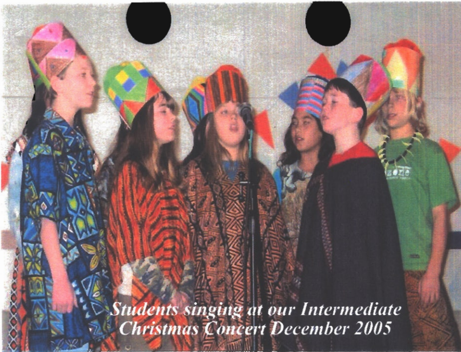
Students singing at our Intermediate Christmas Concert December 2005

Windebank staff are committed to maintaining and improving student achievement. This Fall, the staff met to determine the goals we wish to pursue during the course of the year.