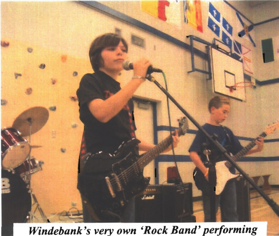
Windebank's very own 'Rock Band' performing at an assembly this year.

has allowed students to develop their physical agility and problem-solving skills.