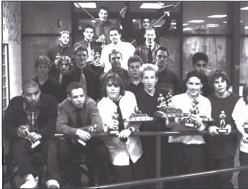
This year's MVP recipients from the Grade 8, Junior and Senior Football teams display their hardware.