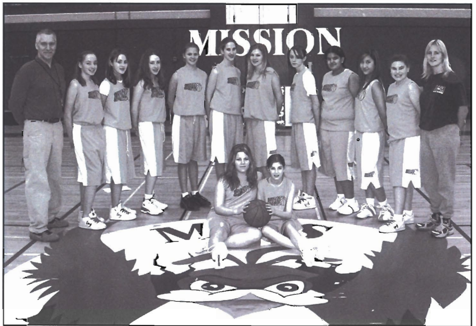
The Grade 8 girls basketball team continues the tradition of excellence.

This year began the first of a three year implementation process, introducing a "new" graduation program in British Columbia. Our current grade 11's and 12's will graduate with a minimum of 52 credits, while the current grade 10 students will be required to earn a minimum of 80 credits (grade 10-12) to satisfy graduation requirements.