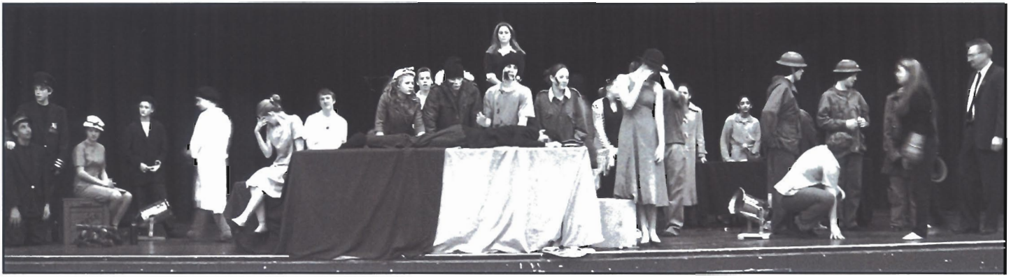
The Drama Classes perform "Bury the Dead" for Remembrance Day.

collaboratively to develop a cross department Social Studies 10 exam.