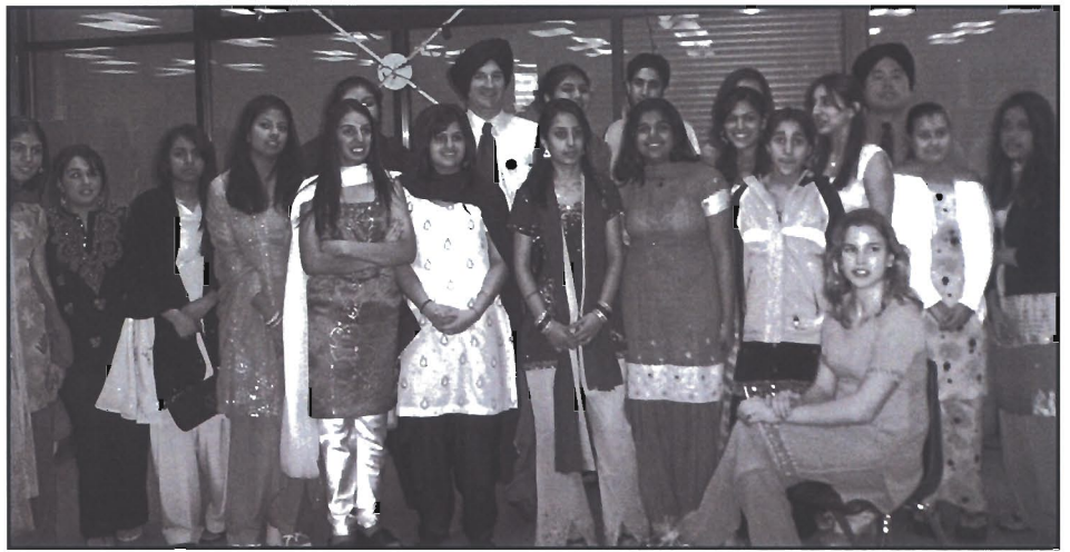
Diwali is celebrated annually at MSS.

It's been an exciting year in the Science Department of Mission Secondary. The most exciting news to come is that we are offering a new course next year! After many long hours of preparation,